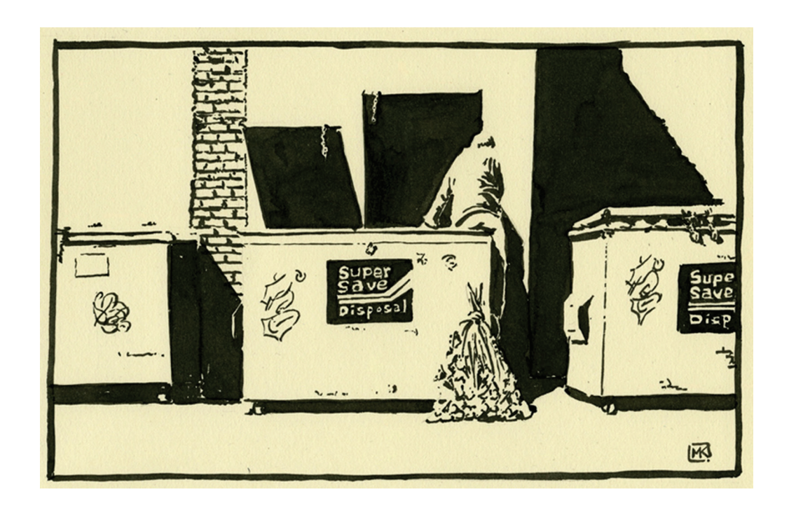
Drawings from a series documenting the indigent of Vancouver.

Hockney remarked in his book Secret Knowledge: Rediscovering the Lost Techniques of the Old Masters, the European art tradition is the only one where shadows are a structural part of representational artwork. Until the innovations of Impressionists like Claude Monet, much European oil painting had been "light over dark"—Rembrandt and Caravaggio being obvious examples—ensuring that shadows formed an essential part of compositions. Chiaroscuro (light-dark in Italian, implying nowadays no intermediate tones) begins to appear in European art with Leonardo da Vinci's works.